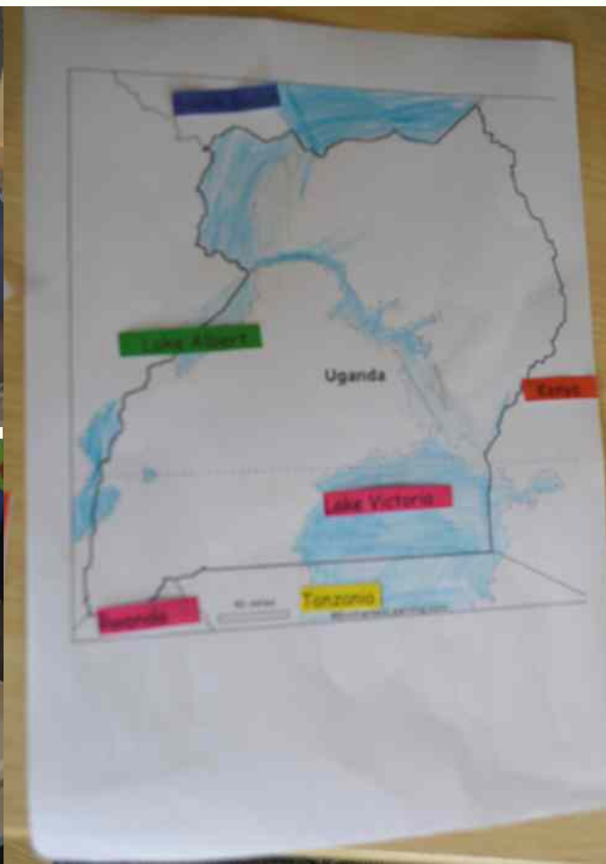
Global Perspectives Project work in year two!