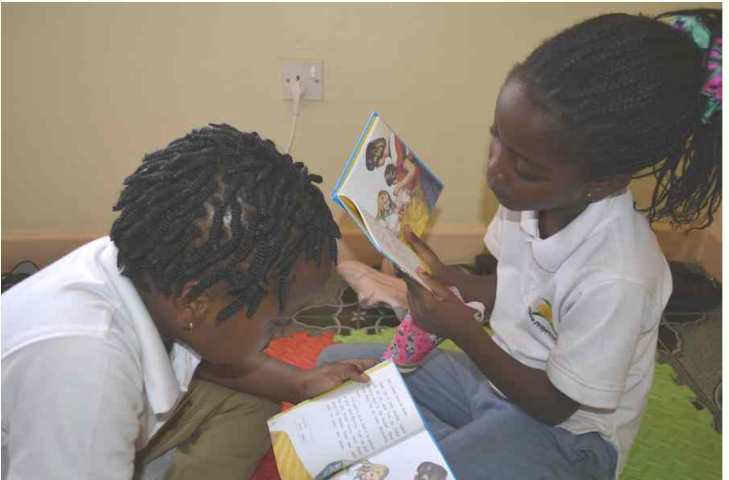
Story book time in the library!