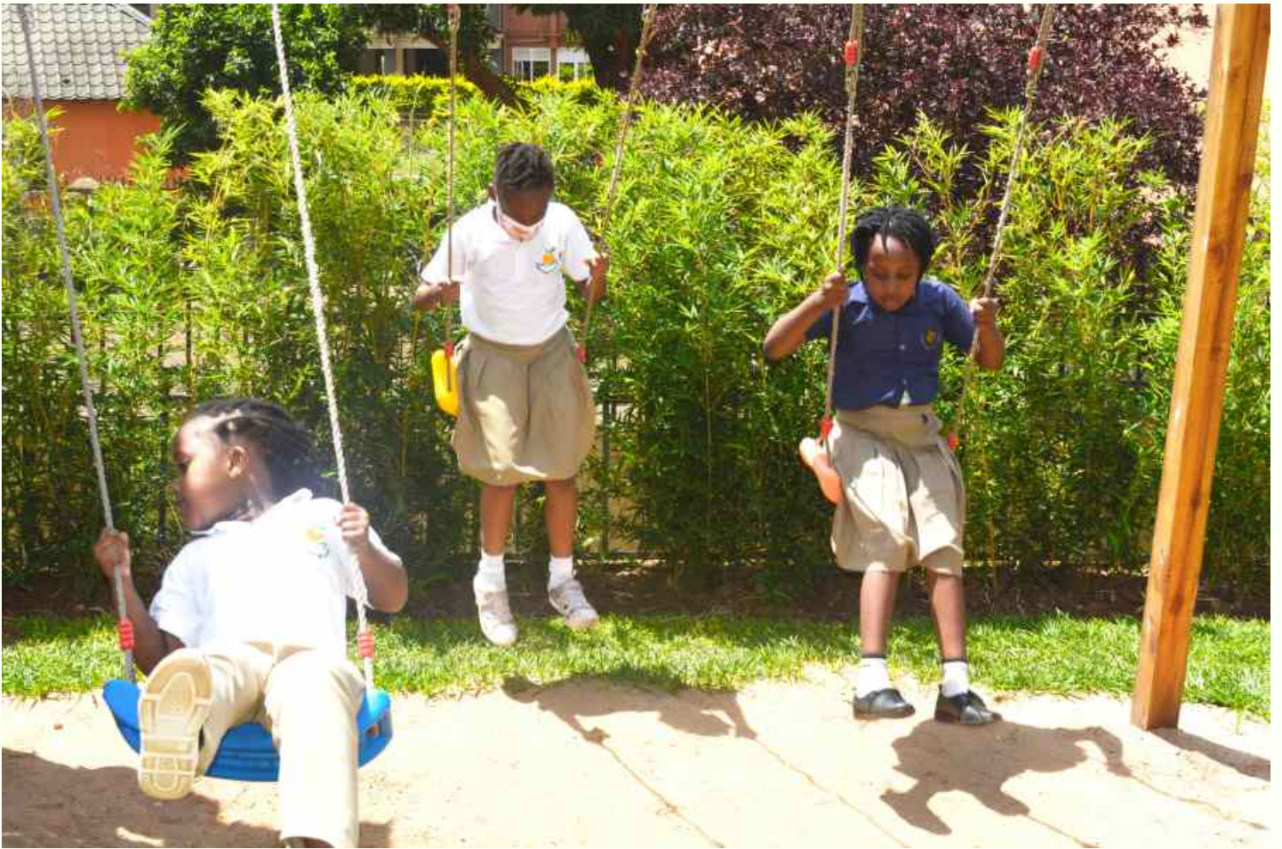
We love to play in the outdoors!